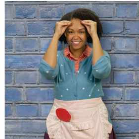
at his teaching."